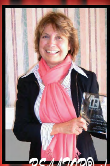
REALTOR® of the Year