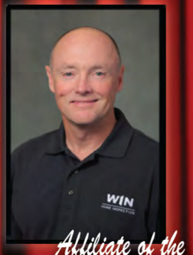
Affiliate of the Year